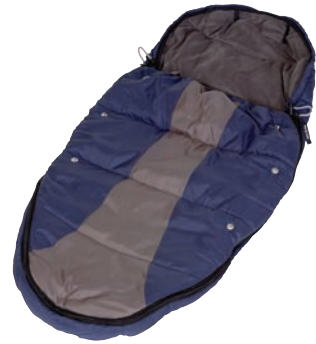
snuggle & snooze